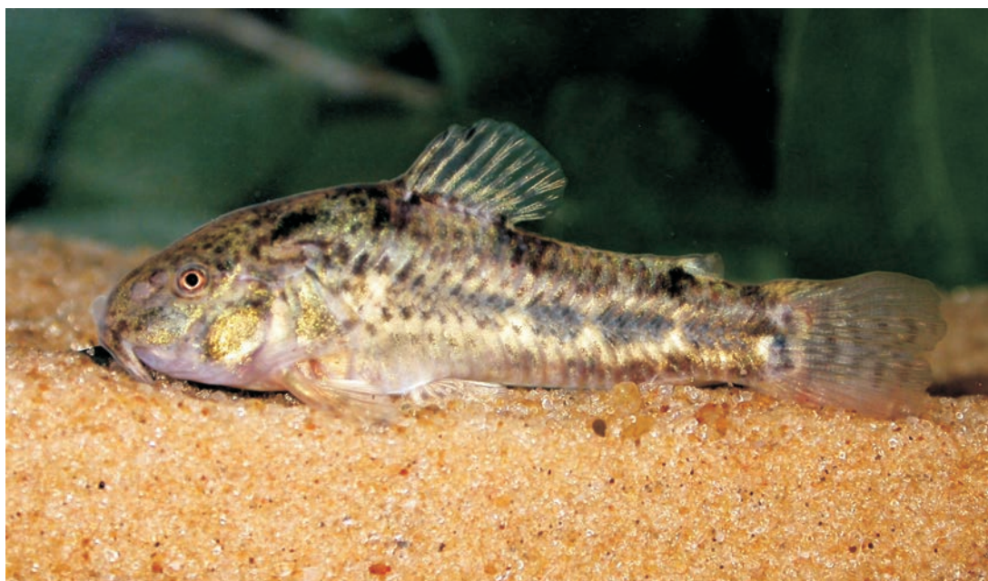
Fig. 1. Corydoras gladysae sp. n., MACN 9232, live holotype, 35.0 mm SL. Argentina, Salta province, Calchaquí river (S 25° 2' 59" - W 66° 6' 25").

Paratypes. MCNI 712, 4 specimens, 37.5–28.5 mm LE; Calchaquí river, Cachi Department, Salta province, Coll. Gonzo y Martínez, January 19, 2002. MCNI 913, 4 specimens, 37.5–27.6 mm SL; Calchaquí river, (S 25° 7' 17" and W 66° 9' 35"; Altitude: 2325 m.a.s.l.) Cachi Department, Salta province, Argentina. Coll. Gonzo and Martínez, December 7, 2003.