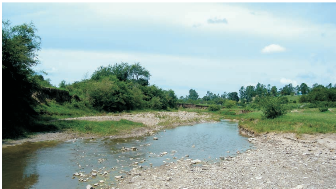
Fig. 7. Stream 200 meters from its junction with the San Lorenzo river (S 24° 47' 08" - W 65° 28' 10"; Altitude: 1222 m.a.s.l.), Finca Las Costas, around Salta city, Argentina.

Color in formol. Ground color of head grayish brown. Opercle dark brown or reddish grey. Preopercular edge light yellow. Ventral region of head light. Dark brown irregular blotch between opercle and parieto-supraoccipital process. Barbel yellowish or light yellow.