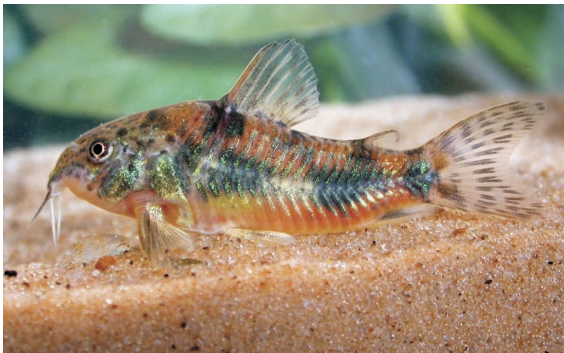
Fig. 5. Corydoras cf. paleatus , MACN 9237, live specimens, 42.0 mm SL. Argentina, Salta province, small stream 200 meters from its junction with the San Lorenzo river (S 24° 47' 08" - W 65° 28' 10").

specimens, 29.6–37.0 mm SL, Argentina: Salta province, Lesser river, La Caldera Department, (S 24° 40' 39" – W 65° 28' 33"; altitude: 1463 m.a.s.l.). Coll.: P. Calviño & F. Alonso, January 17, 2006; MACN 9235, 9 specimens, 12.3–35.7 mm SL, same locality as MACN 9234, Col.: F. Alonso, January 2007; MACN 9236, 25 specimens, 27.8–37.9 mm SL, Argentina: Salta province, Gallinato creek, La Caldera Department, (S 24° 40' 59" – W 65° 17' 32"; altitude 1159 m.a.s.l.). Col: F. Alonso, January 20, 2006; MCNI 498, 5 specimens, 36.7–40.0 mm SL, Argentina: Salta province, La Caldera river, La Caldera Department. Coll.: Barrros and Rosa, February 5, 1995.