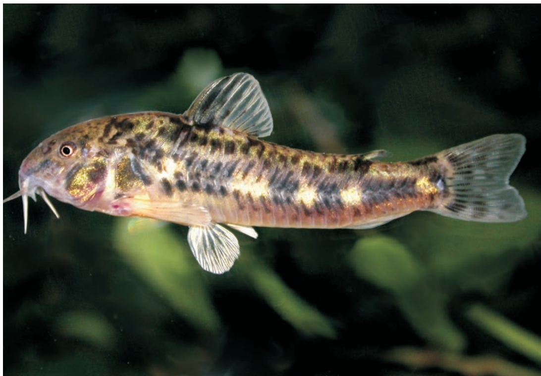
Fig. 4. Corydoras micracanthus , MACN 9234, live topotype, 35.1 mm SL. Argentina, Salta province, Gallinato creek (S 24°40'59" – W 65°17'32").

all its surface a great part of the year increasing its caudal in the summer, the rainy season. Nevertheless, near its junction in the San Lorenzo river, it has surface water all the year (pers. obs.), probably due to a subterranean water flow from this last river. The Lomas de Medeiros hills were the ancient alluvial cone of Wierna river (Igarzábal & Medina, 1991).