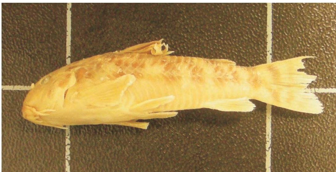
Fig. 3. Corydoras micracanthus, BMNH 1897.1.27.9-14, paralectotype, 38.1 mm LE; Argentina, Salta province.

praecipital process. Barbel yellowish or light brown.