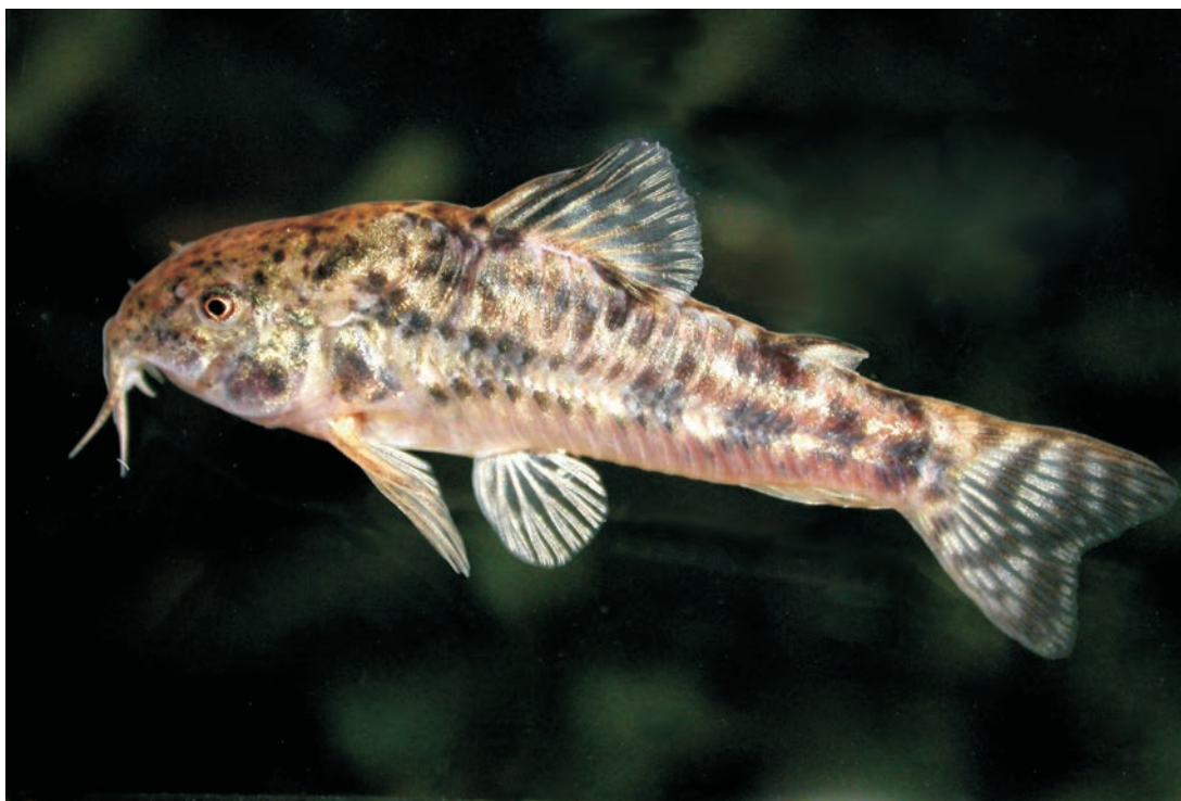
Fig. 2. Corydoras petracinii sp. n., MACN 9233, live holotype, 36.0 mm SL. Argentina, Salta province, San Lorenzo river (S 24° 47' 08" - W 65° 28' 10").

Calchaquí river, in the sub-Andean range system, at Cachi and Payogasta localities, in Cachi Department, Salta, Argentina (Fig. 6). This river is a tributary to the superior river basin of the Juramento river, that ends in Paraná river. According to Gonzo (2003), the Calchaquí river is the main collector of the Calchaquíes Valleys. This river and its tributaries conform a dendritic network of Atlantic drainage with a surface estimated at 14.175 km 2 and a perimeter of 640 km. Its layout fits into the disposition of mountainous cords and crosses intermountainous valleys of southern course. This river begins at the Nevado del Acay, at 5716 m.a.s.l., where it reaches its maximum height. Its length is 252 kilometers. The drainage network has a remarkable contrast between the East and west the latter with a greater number of affluents of permanent regime, oriented from West to East, and whose volumes are fed by defrosting water (Gonzo, 2003). The diversity of fish of this river is scarce, but most of them are endemic species, of limited distribution, sometimes only in certain sections of the water course.