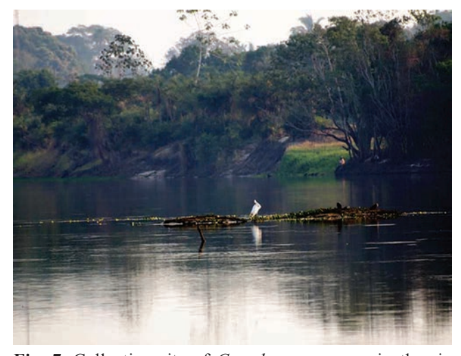
Fig. 7. Collection site of Corydoras guapore in the rio Guaporé, Mato Grosso State, Brazil, around the geographic coordinates 15°01.0642'S 59°95.762'W.

Ecological notes. Corydoras guapore is a free-swimming species, which occupies the middle of the water column in a small group when they feel safe (Fig. 5a), similar to the observed in C. hastatus. They form small breeding groups of up to 20 specimens associated to aquatic macrophytes, like Eichhornia. Unlike most of the Corydoras species which generally inhabit streams or the main channel of rivers, C. guapore is generally captured in lentic habitats as ponds and lakes (Hans-Georg Evers, pers. comm.). The specimens examined herein were captured close to the banks of the rio Guaporé, in Mato Grosso State (Cláudio Oliveira and Markos Alexandrou, pers. comm.) (Fig. 7).