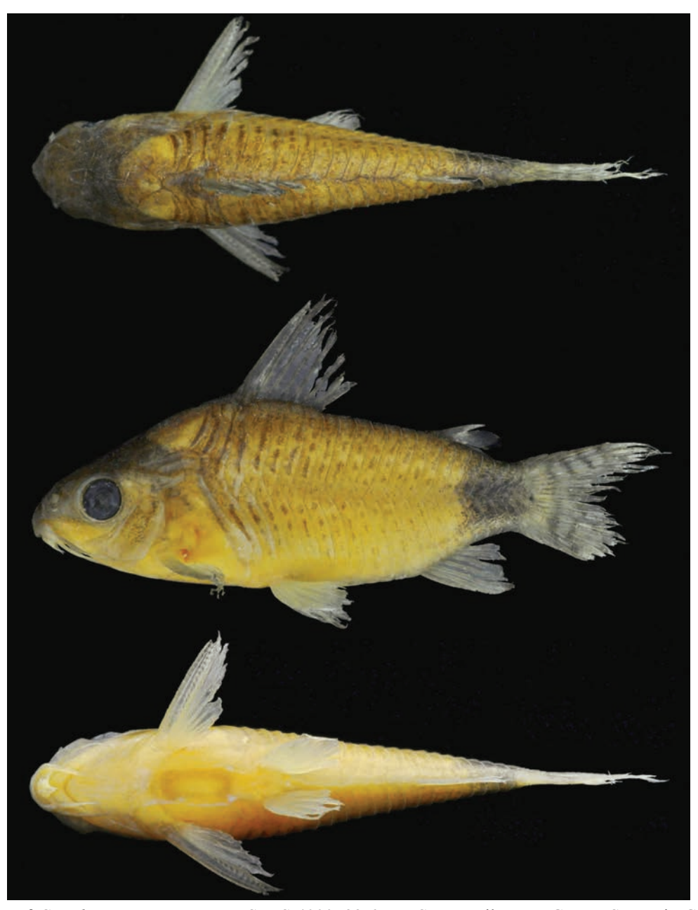
Fig. 2. Topotype of Corydoras guapore , ZUFMS-PIS 4000, 33.6 mm SL, Brazil, Mato Grosso State, rio Guaporé. Dorsal, lateral and ventral views.

projection well developed. Preopercle slender, elongated, with minute sparse odontodes on external surface. Opercle dorsoventrally elongated, width equal or smaller than length; free margin slightly convex, without serrations and covered by small odontodes. Anteroventral portion of cleithrum and posterolateral portion of scapulocoracoid exposed. Anteroventral and posteroventral suture between cleithrum and scapulocoracoid exposed; moderately developed odontodes sparse on exposed areas. Vertebral count 22(2); ribs 7(2), first pair conspicuously larger; complex vertebra slender in shape. Neural and haemal spines with laminar expansions on anterior margin of proximal region; expanded in distal tips.