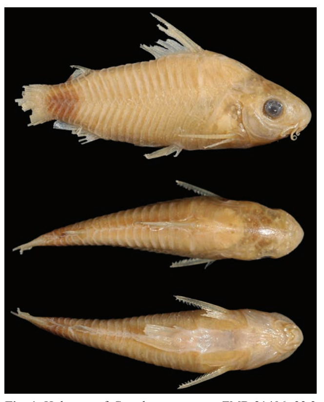
Fig. 1. Holotype of Corydoras guapore , ZMB 21406, 33.3 mm SL, Brazil, Rondônia State, main stream of the upper rio Guaporé. Lateral, dorsal and ventral views.