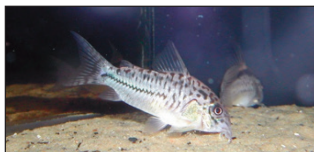
Fig. 4 – C019