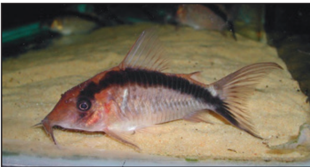
Fig. 8 – CW006