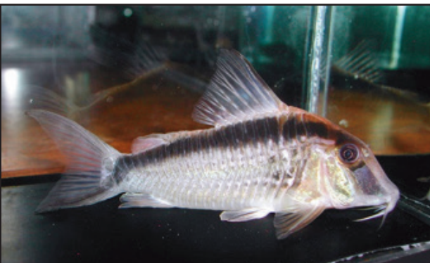
Fig. 9 – C. narcissus

There is also a species that has not been assigned a code number yet that has shown up in two shipments from Manaus, Brazil (Fig. 10).