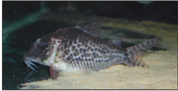
Fig. 10 – Corydoras sp imported from Manaus, Brazil.

Lineage 8, sub-clade 4 – undescribed genus: C098, CW006. Lineage 9 – Hoplisoma (as Hoplosoma ): C. arcuatus , C. evelynae , C. urucu , C019, C098, C100, CW036