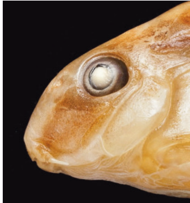
Fig. 14 – Head profile of BMNH 1958.6.9.1 (C020)

In the specimens usually captioned as C. arcuatus (including the specimen on the plate of the original description, which I consider to be the paratype) the head and snout has a more rounded or curved angle than the holotype of C. arcuatus and CW036, giving the snout a shorter look (Figs. 14 and 15).