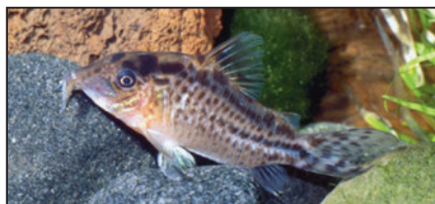
Fig. 5 – C098