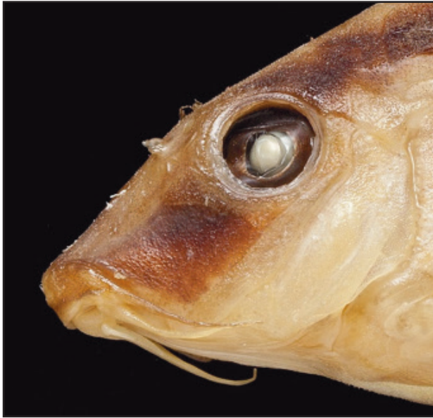
Fig. 12 – Head profile of holotype of C. arcuatus

profile that appears straighter and more extended, giving the snout a longer look (Figs. 12 and 13).