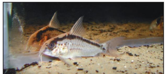
Fig. 18 – Possible adult C. urucu

A specimen was imported along with C. evelynae by Pier Aquatics (Wigan) which could represent an adult C. urucu (Fig. 18), and this did appear somewhat different to C020 from Peru.