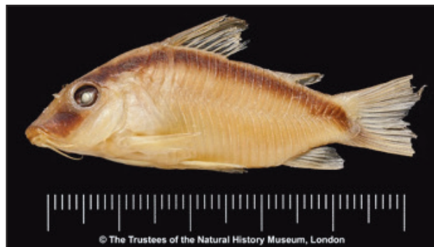
Fig. 11 – Holotype of C. arcuatus

Since observing an image of the holotype of C. arcuatus (Fig. 11) years ago, I have queried whether the fish depicted in scientific papers (e.g. Nijssen & Isbrücker, 1986:Fig. 29; Castro, 1987:Pl. 2, Fig. 1; Britto et al, 2009:fig. 2B) and in aquarium publications (e.g. Glaser et al, 1996:67, 68 (upper); Fuller and Evers, 2005:67, 68 (upper)) are the true C. arcuatus .