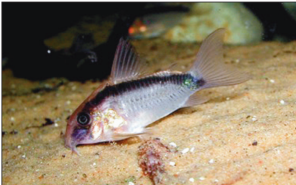
Corydoras C020 – the fish known in the hobby and scientific publications as C. arcuatus

The name Corydoras arcuatus has been given to aquarium fish for many years now. However, the actual true identity of the species described by Elwin in 1938 is not as clear as one may think.