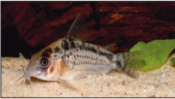
Fig. 6 – C100