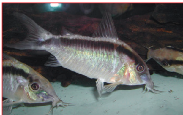
Fig. 2 – CW036

The name Corydoras arcuatus has been given to aquarium fish for many years now. However, the actual true identity of the species described by Elwin in 1938 is not as clear as one may think.