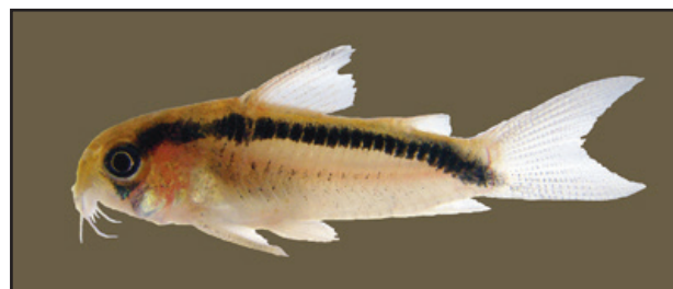
Fig. 3 – Holotype of C. urucu

The code number C020 was given to a specimen from Rondônia, Brazil; CW036 was designated for the so called ‘Super Arcuatus’ from Rio Madeira, Brazil; and Britto et al (2009) described Corydoras urucu from the Rio Urucu basin, Rio Solimões system, Brazil. Also, C019 (Brazil), C098 (Brazil), C100 (Rio Negro, Brazil), C. evelynae Rössel, 1963 (Upper Rio Solimões, Amazonas, Brazil), CW006 (Peru), and C. narcissus Nijssen & Isbrücker, 1980 (Rio Purus system, Brazil) all share the similar arched band pattern, although in some the pattern is discontinuous.