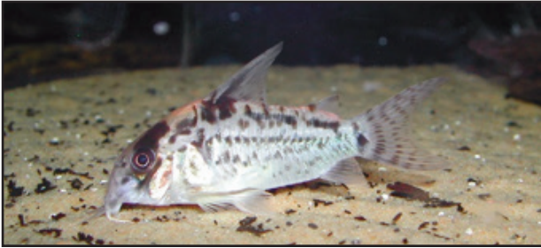
Fig. 7 – C. evelynae