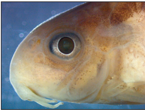
Fig. 16 – Head profile of holotype of C. urucu – image by Wolmar Wosiacki

In the holotype of C. urucu the head and snout has an even more rounded or curved angle than holotype of C. arcuatus and the specimens usually captioned as C. arcuatus (Figs. 16 and 17).